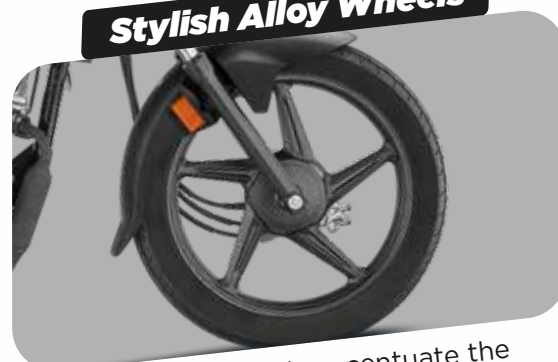
Stylish Alloy Wheels All-black alloy wheels accentuate the overall look of the bike.