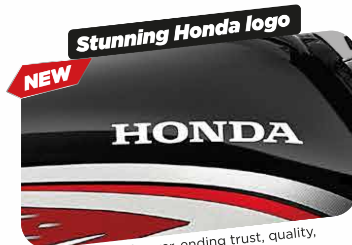
The symbol of never-ending trust, quality, and reliability.