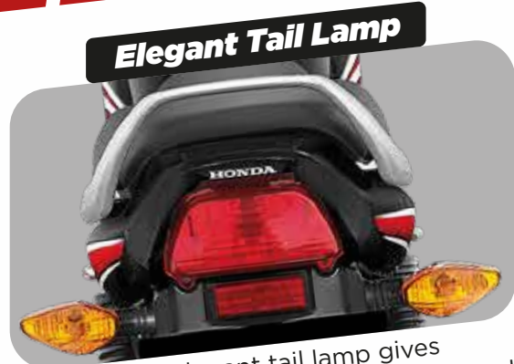
Elegant Tail Lamp Bright and elegant tail lamp gives the bike an imposing look from the back.