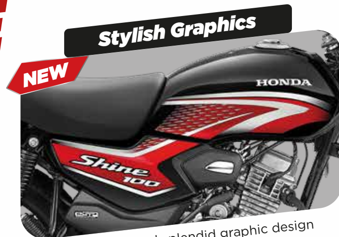
All new enriched and splendid graphic design that compliments the overall look of the bike.